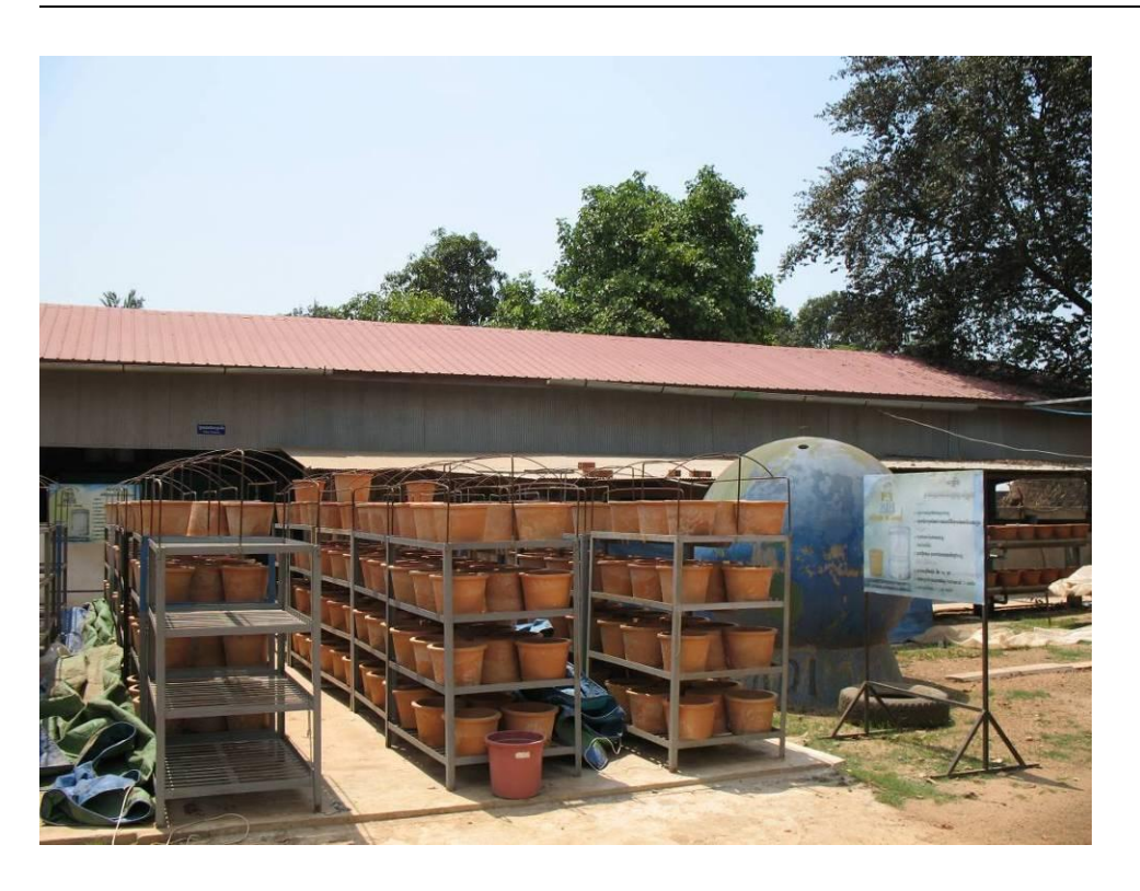
XII. Quality control and silver nitrate painting area