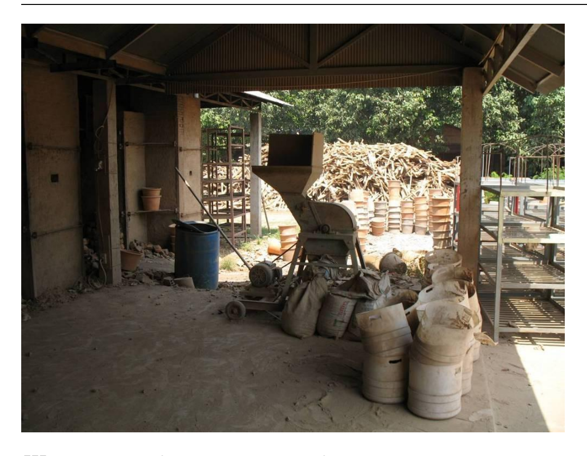
III. Rice husk (burn-out material) storage area